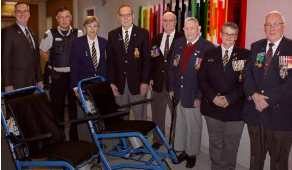
Members of the Royal Canadian Legion showcase a few of the Staxi chairs funded by a generous gift of $20,000 from the people of Saskatoon through the Saskatoon Poppy Fund